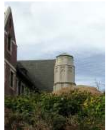
REGIS UNIVERSITY Denver, CO