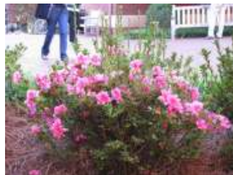
NLSAM July 28-31, 2011