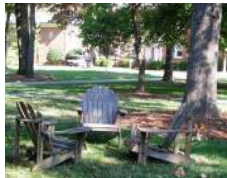
Queen's University in Charlotte, North Carolina

See NLS Palanca Web page for current information of 2011 weekends.