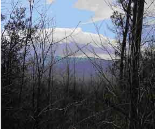
View from a trail in the Great Smoky Mountains